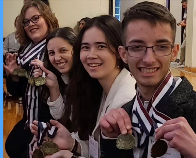
Sports Medicine and Pre-Nursing students