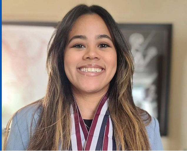
Medical Laboratory and Phlebotomy Students