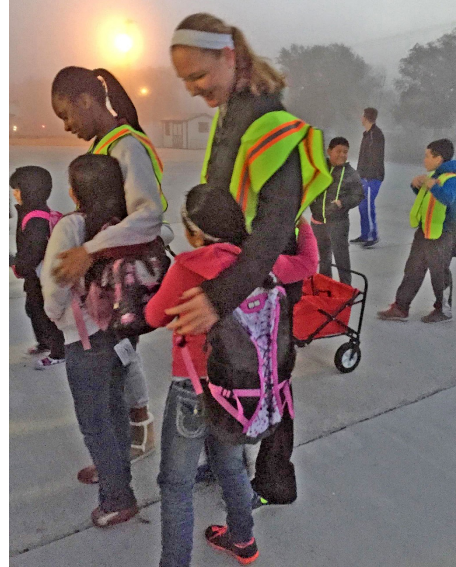
Walking School Bus Volunteers