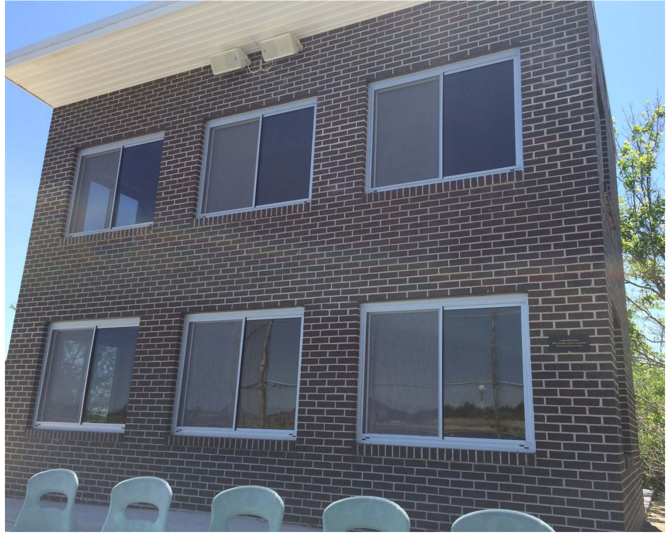
Bowman Family Press Box