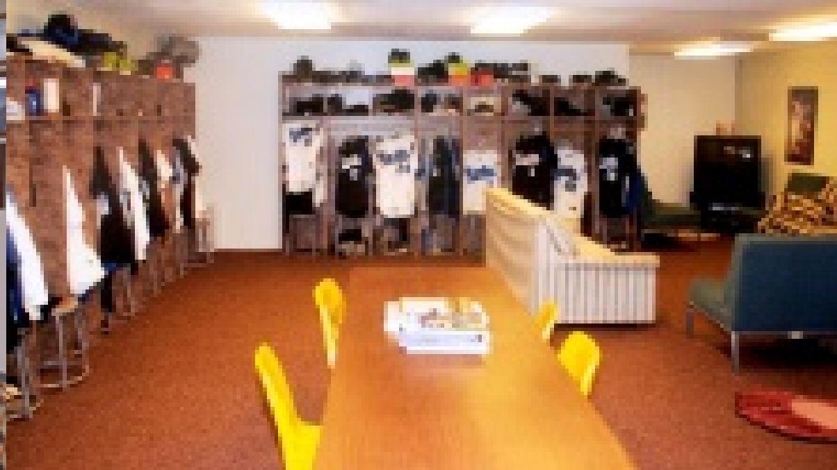
Baseball Club House