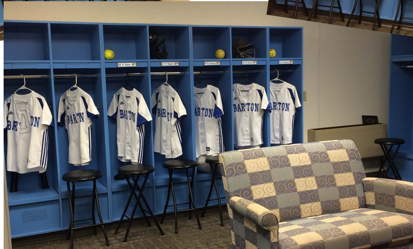
Softball Locker Room