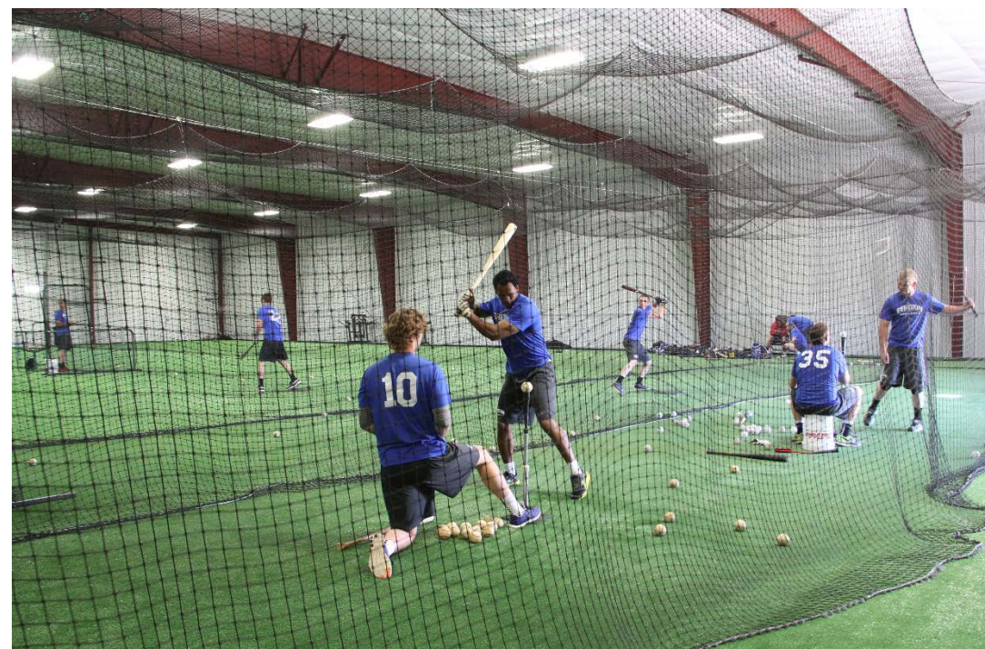
Indoor Turf Facility