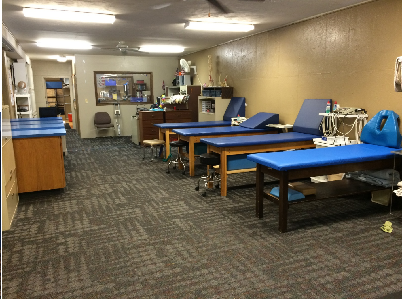
Athletic Training Room