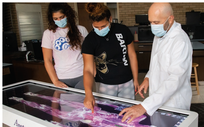
Anatome Table, purchased by the Foundation

The Foundation coordinates multiple friend- and fund-raising activities and events each year to benefit the college and encourages private donors and organizations to support Barton. For more information on how you can advance academics through the Barton Community College Foundation, contact us at (620) 792-9306, foundation@bartonccc.edu , or 245 NE 30 RD, Great Bend, KS 67530 . All donations are tax deductible.