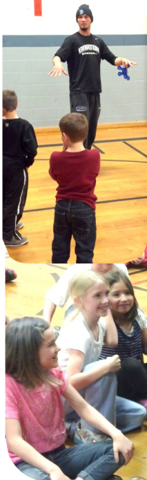
Members of the Barton Baseball Team helped the Barton Admissions Office to reward students at Lincoln Elementary with outstanding attendance awards.