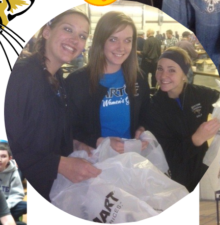
Members of the Barton Men's and Women's Golf Teams recently assisted the Great Bend Kiwanis Club with their annual Pancake Feed in Great Bend.