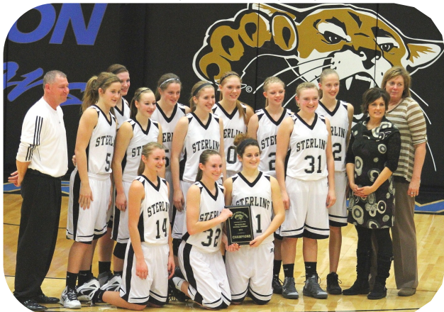
Hilltop Hoops Classic Champions - Sterling High School