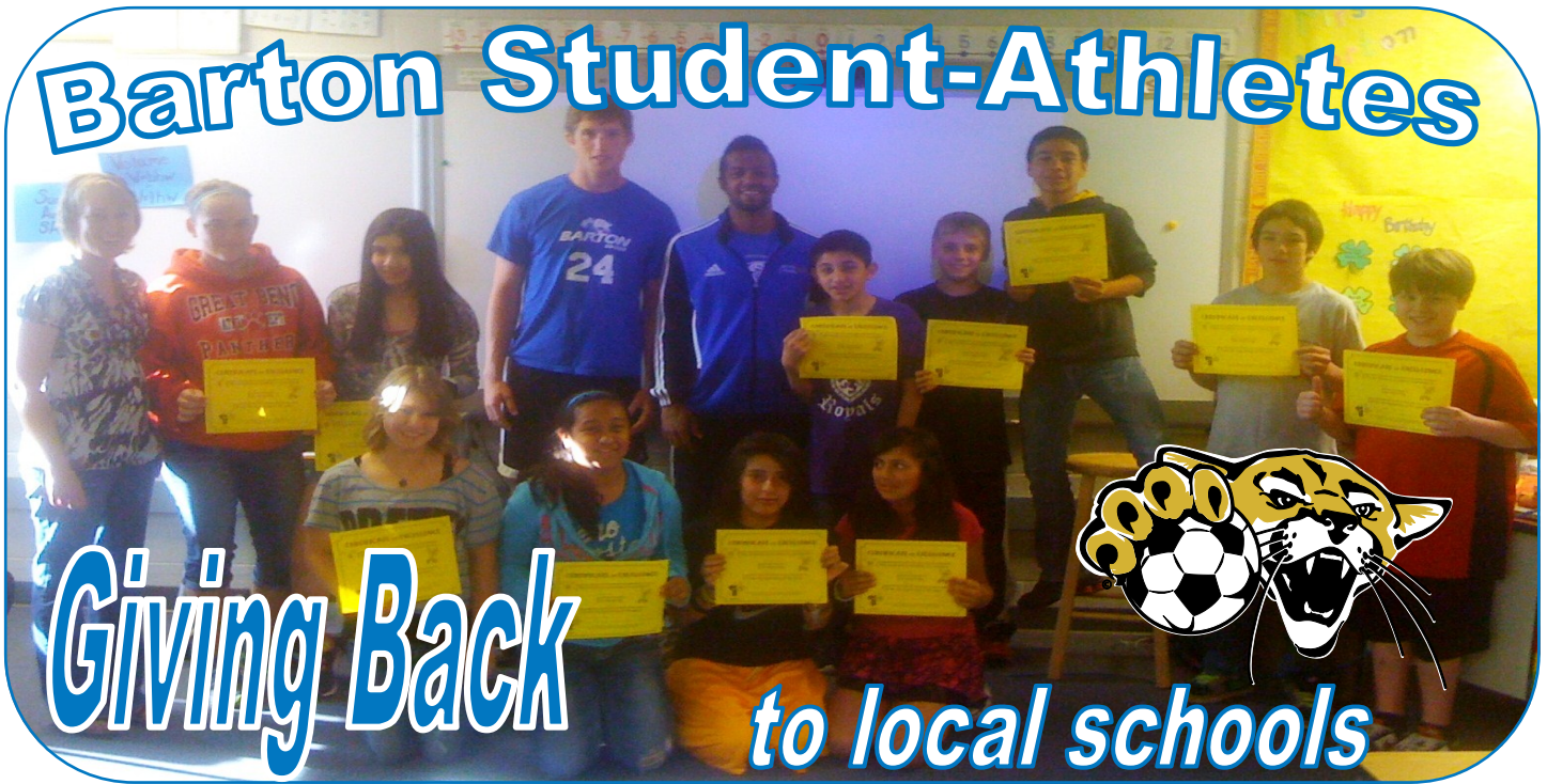
Members of the men's soccer program helped reward the Great Bend Middle School math program including motivational talk and some fun with soccer.