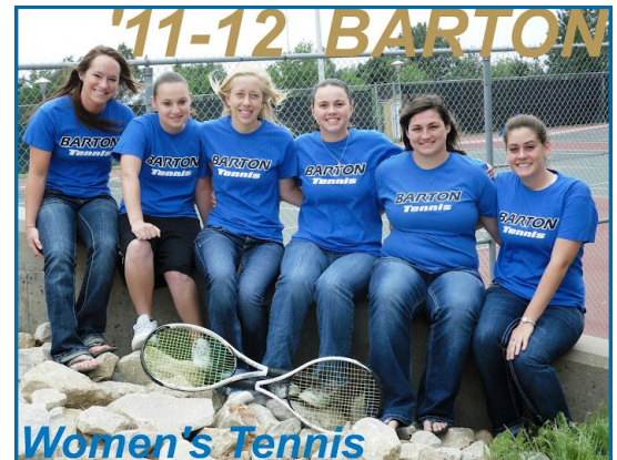
Barton's Tennis team is expected to vie for national tennis academic honors to be released later this month. July's issue will feature how Barton teams stack up academically.