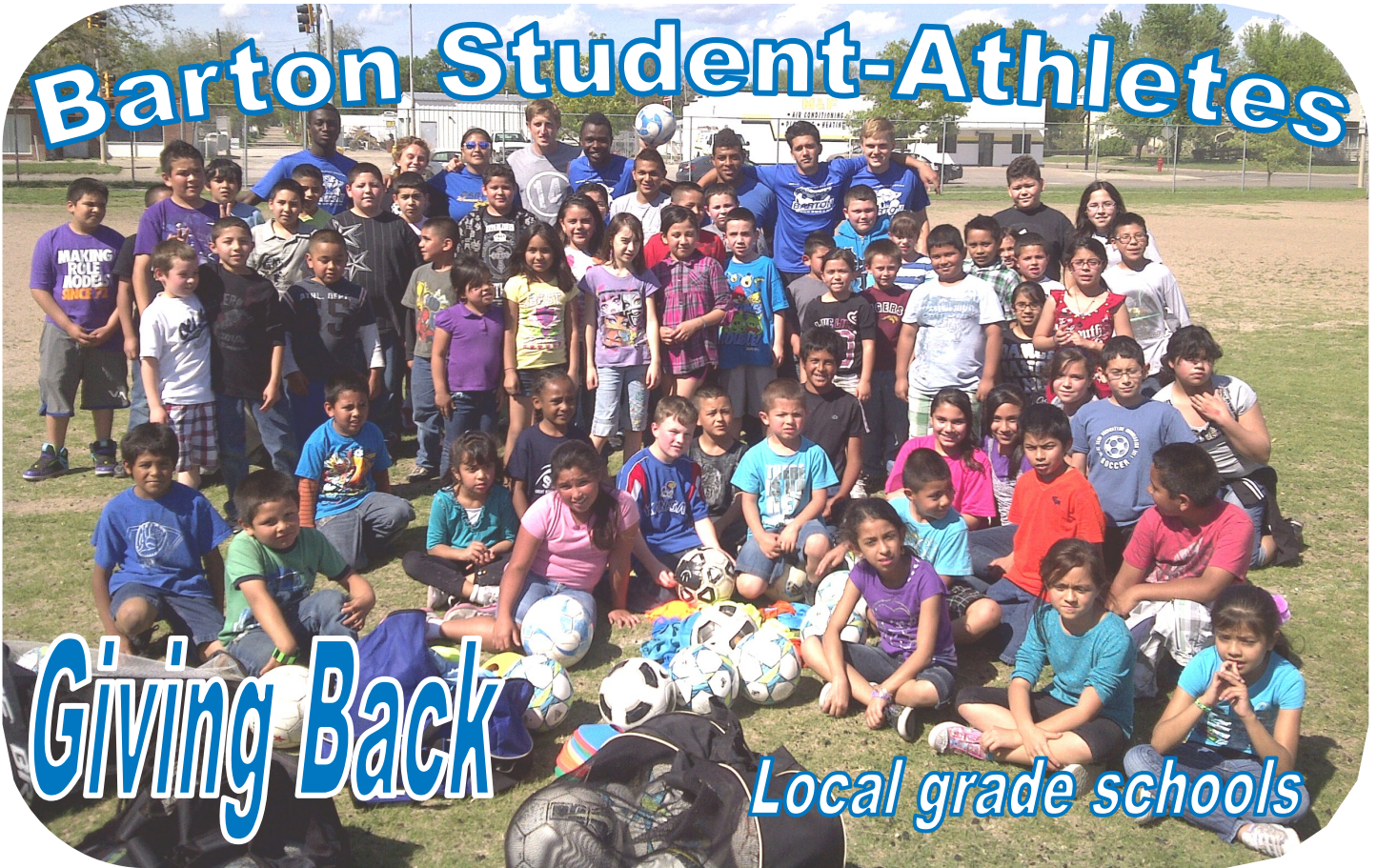
Members of the men's and women's soccer programs regularly visit grade schools including pictured here at Riley Elementary.